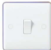
*Image of installed unit, switch supplied separately