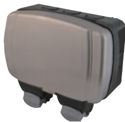
WPL22 RCD (Angled)