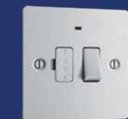
Sleek flat profile