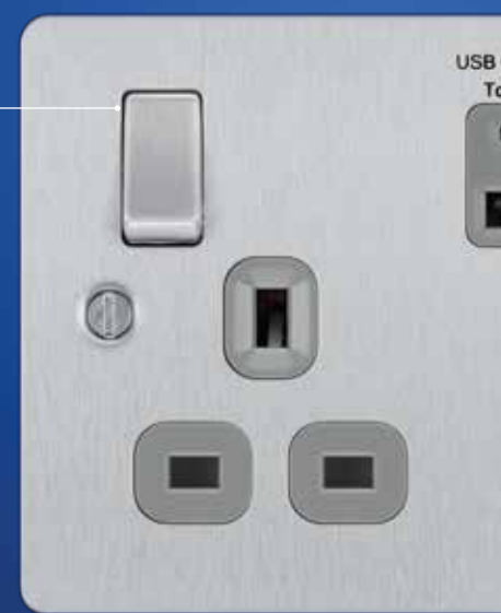
No visible plastic around switches