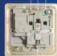
Angled in-line colour coded captive terminals